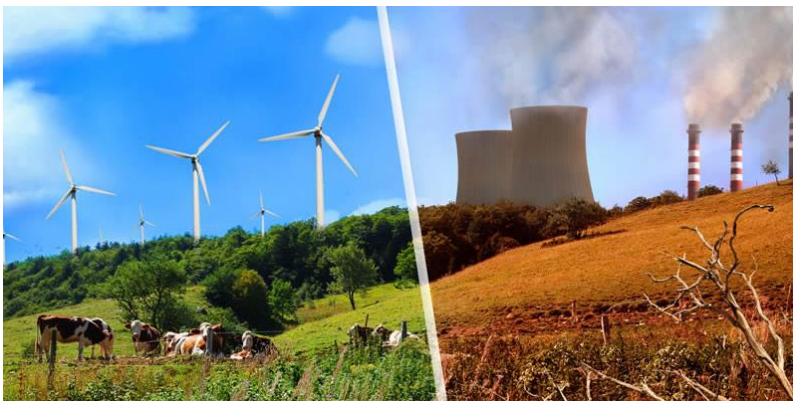
Fig- Environmental difference between Renewable and Non-renewable energy resources. 8

However, developing nuclear energy systems involves considerable technical challenges. Designing and managing these power plants requires specialized expertise and infrastructure, which may not be readily available in all regions. A major concern is the generation of radioactive waste, which remains hazardous for long periods. Exposure to such waste can lead to serious health issues, including cancer, blood disorders, and bone damage. 8