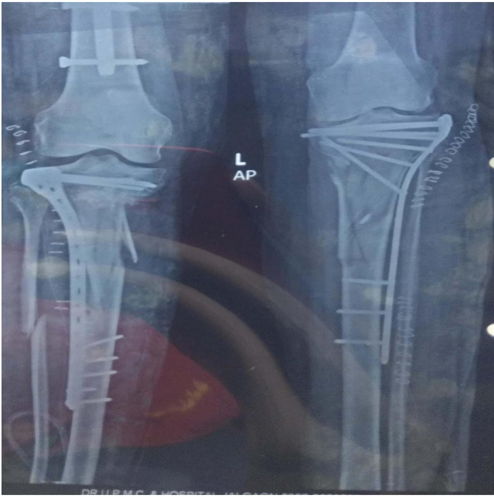
Bilateral OIRF post operative x-ray