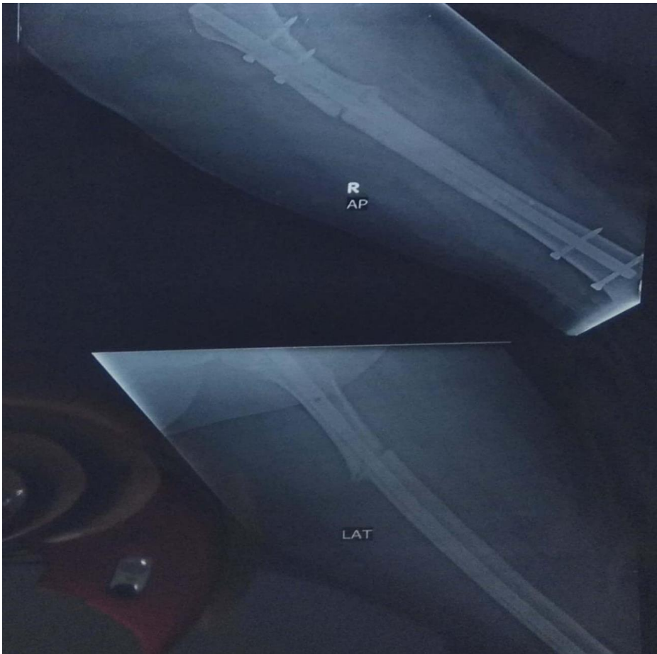
Post operative xray after OIRF