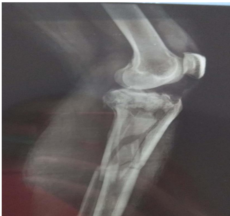
Upper end of tibia comminuted fracture