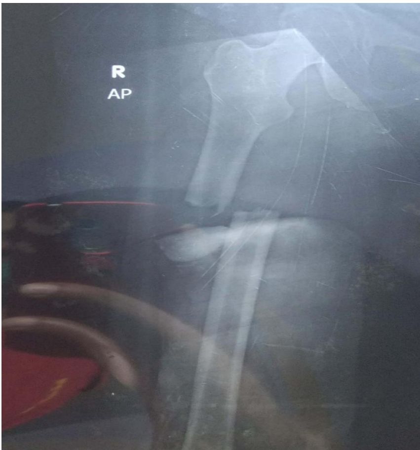
RT shaft off emurdis placed fracture