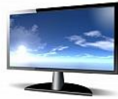
Fig. 2 Example of an unacceptable low-resolution image